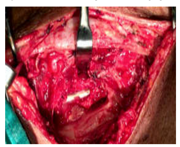
Fig. 2: Mobilized esophagus