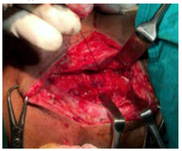
Fig. 5: Final stage of reconstruction